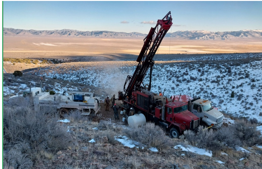
AB's Ingersoll Rand multi-purpose drill rig starts drilling the first drill-hole (PSX22-01)

beginning of the program. The drill rig is truck-mounted with multi-purpose capability. On November 13, 2022, drilling began on the first drill hole, PSX22-01. The collar location, PSX22-E, is shown in the figure below.